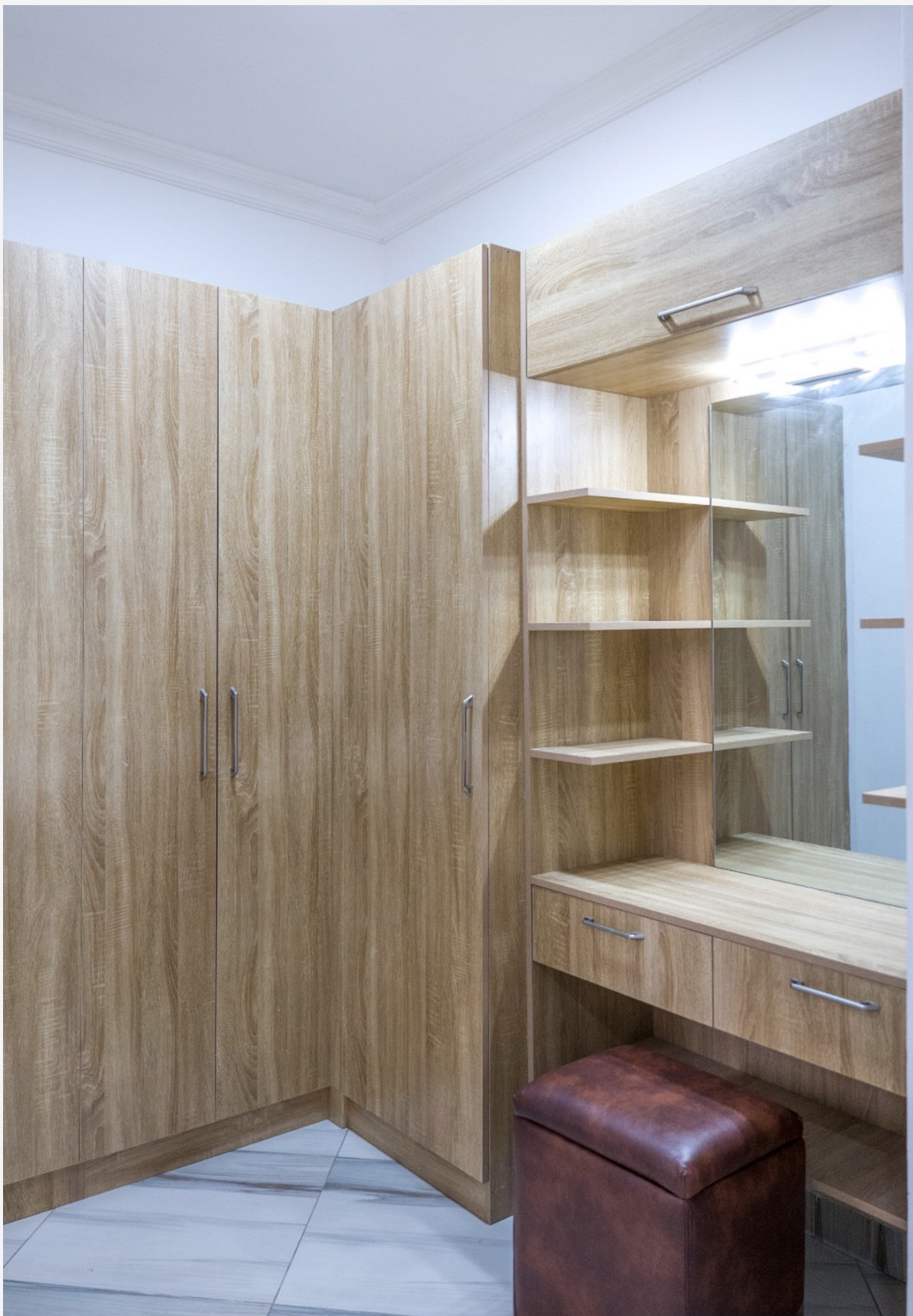
Main Bedroom Dresser