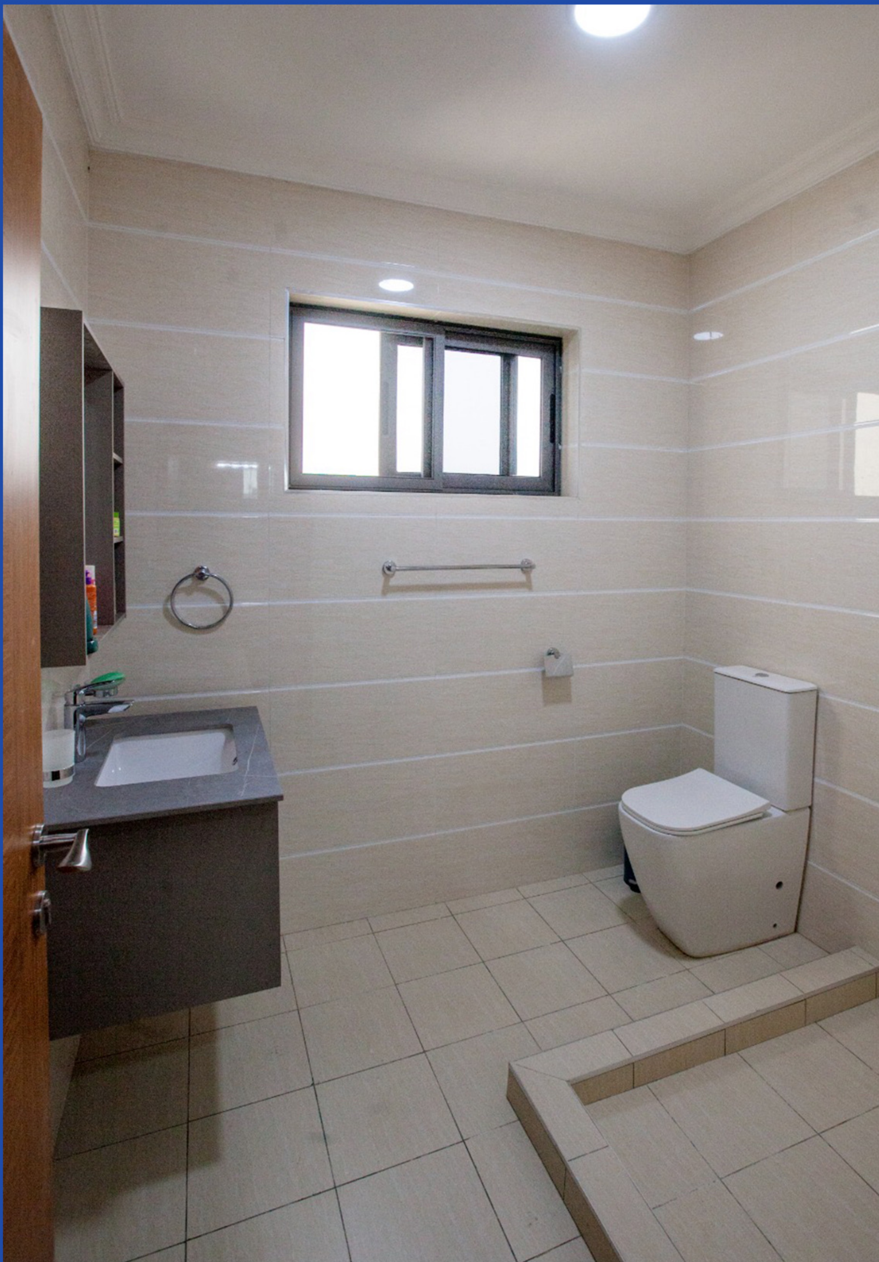
Main Bedroom Bathroom