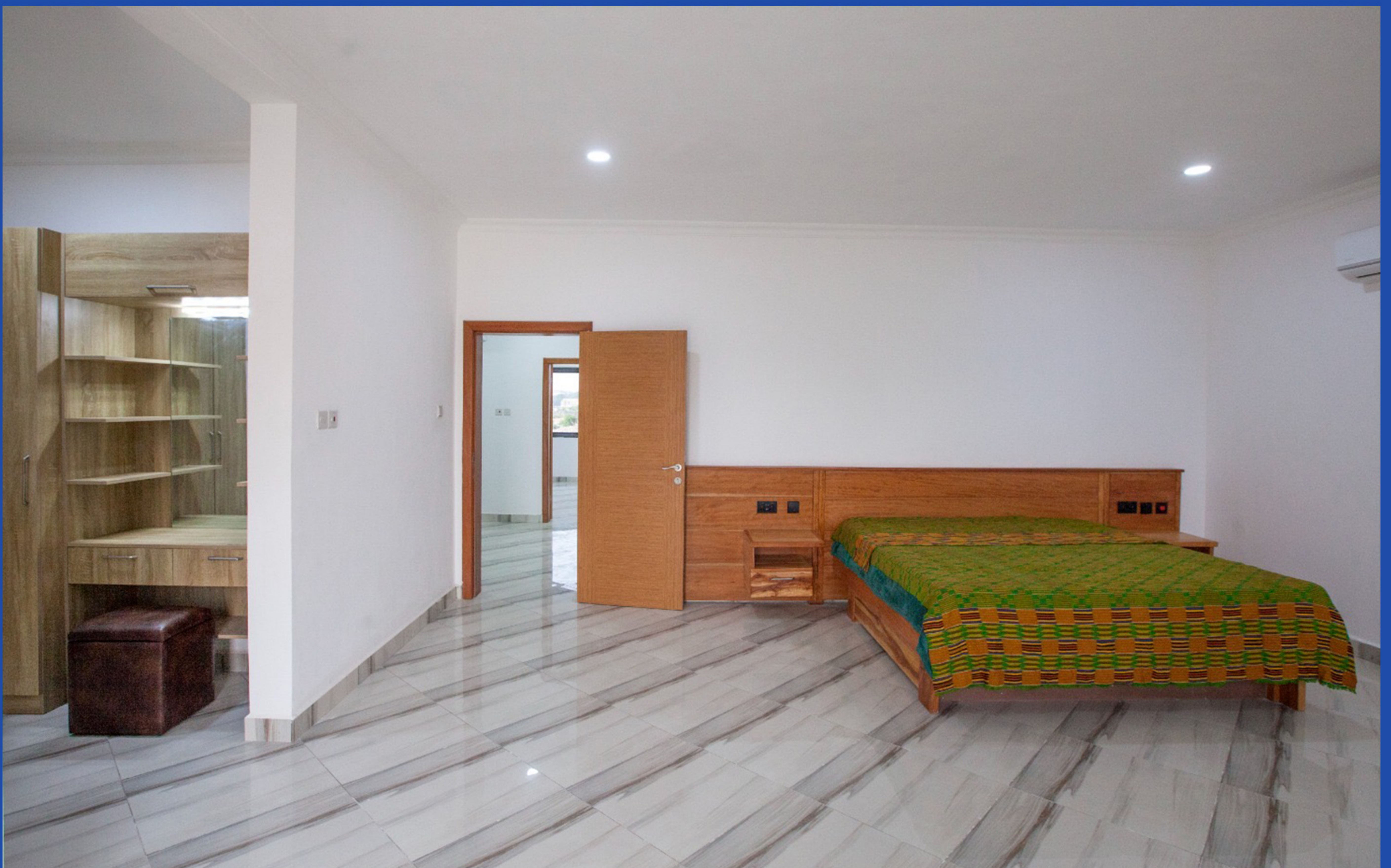
Main Bedroom (Kingsize Bed)