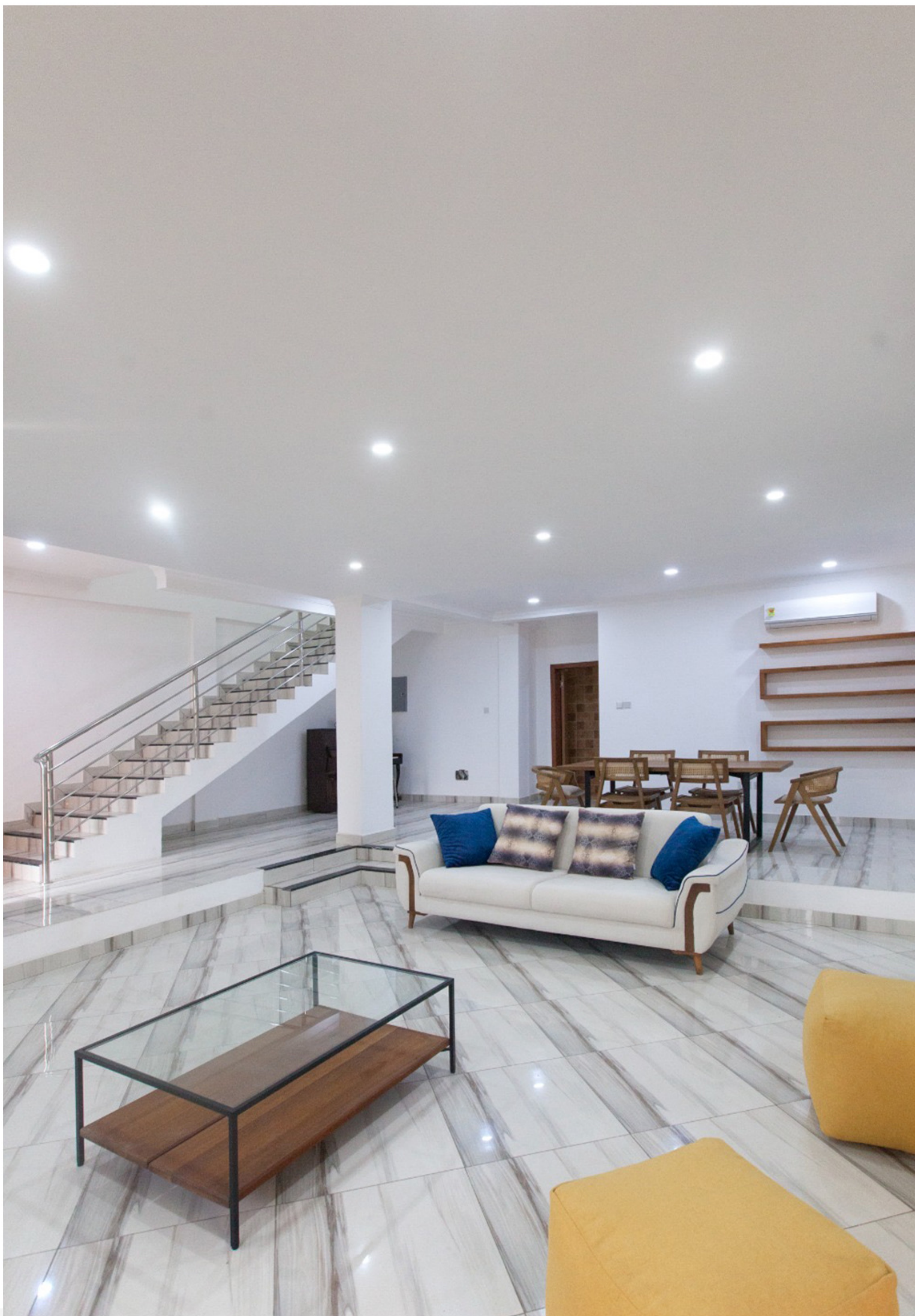
Living & Dining Area